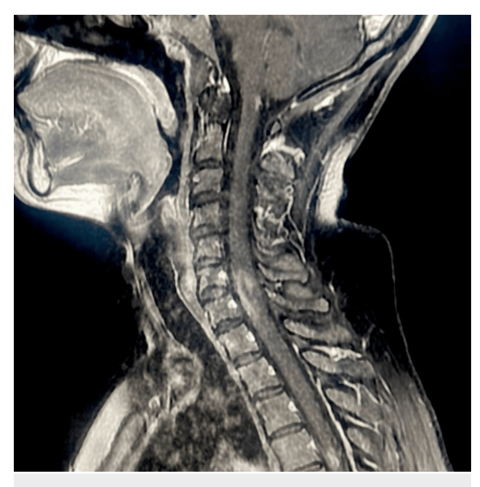
FIGURE 2: MRI of the spinal cord

There is a focal right posterior lesion in the corticomedullary junction, involving short-segment lesions at the cervical and upper dorsal spinal cord levels.